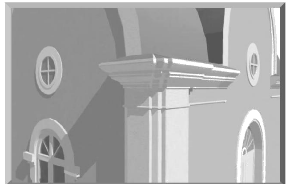
Fig.2. Lateral entrance and corner ornaments